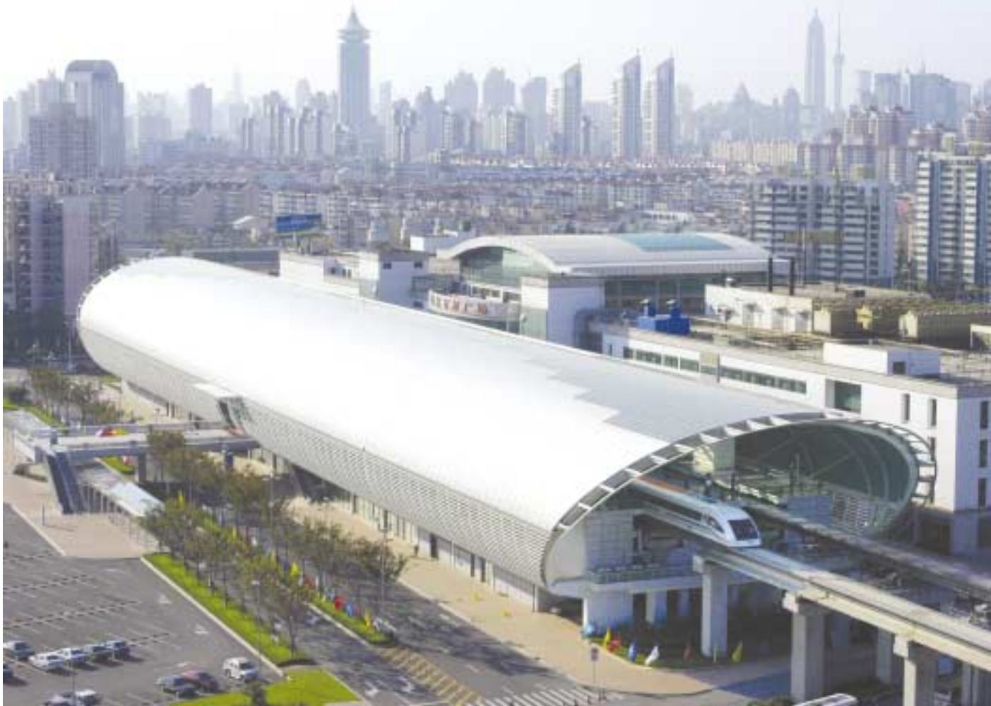
Over 2,500,000 passengers have taken advantage of Shanghai's maglev system, which cuts the 45 minute taxi trip from Longyang station (pictured) to the airport to less than 8 minutes.